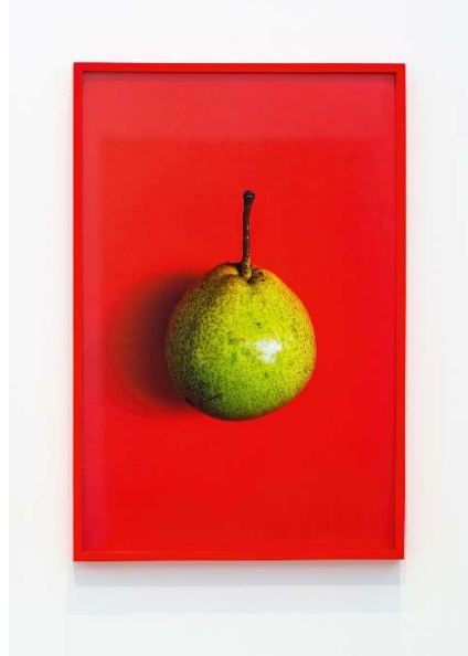
Maximilian Prüfer Performance – Hand Pollination 2018, fine art print